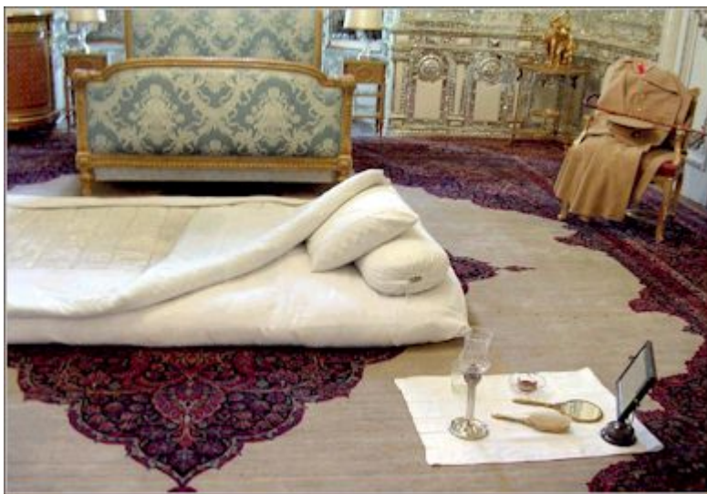
Reza Shah's Bedroom